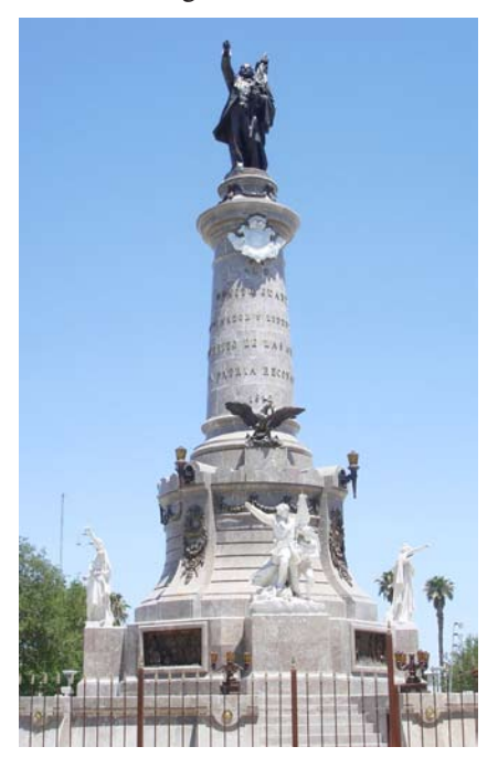
Benito Juarez monument in Ciudad Juarez.

Ciudad Juarez, just across the Rio Grande from El Paso, Texas, used to be a city of 1.4 million people. Now it is dying. During 2010, it had an estimated 3,000 murders, making it one of the most dangerous places on earth. As many as 230,000 people are thought to have fled in fear, as the Juarez and Sinaloa drug cartels battle for control of what was once a bustling border town.