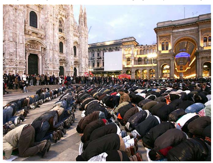
Public prayer in Milan in the square before the famous cathedral.

live in Europe, mostly in Germany, France, the Netherlands, and Austria. Some five million North Africans live in Europe, primarily in France, Spain,