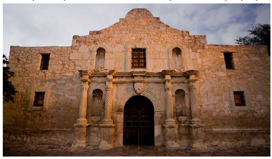
The Alamo: What was it that happened here?

Three counties, Garfield, Arapahoe, and Adams, saw their white percentages drop by more than 10 percent, and the city of Aurora became the first Colorado city with a minority majority: 53