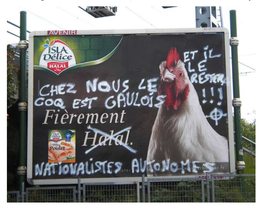
Advertisement for chicken that is "proudly halal." The graffiti says, "Our roosters are Gallic and will stay that way!!! Autonomous Nationalists."

Europe must make a choice: submit to invasion and Islamization, or resist and force Islam back. Unfortunately, the supporters of multiculturalism are still in control of the social debate in Europe.