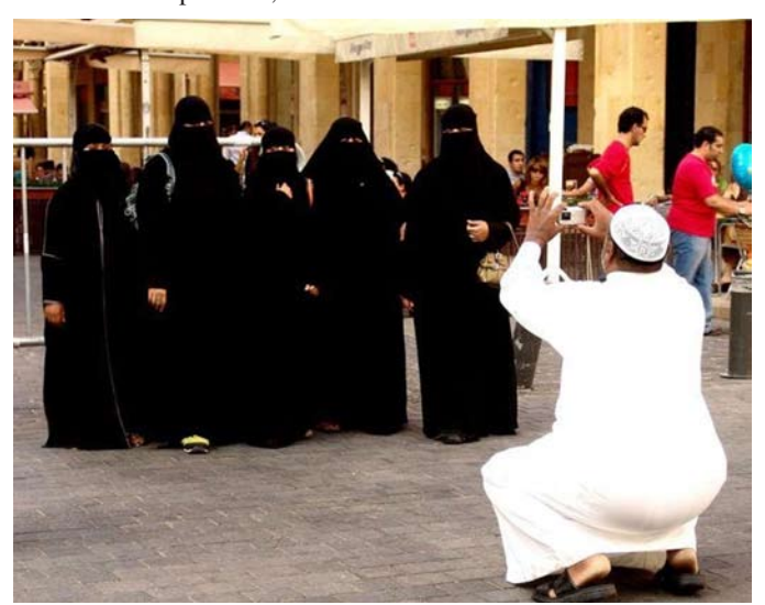
... and more family photos like these.

International migration may bring, in the long run, the most dramatic changes of all in the social, cultural, political, and racial characteristics of