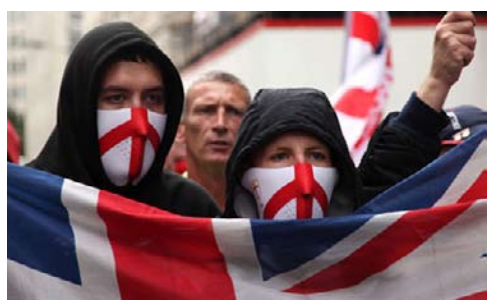
Members of the English Defense League.

British "anti-racists" are fretting over a recent poll that found 48 percent of the population would consider voting for an "anti-immigration English nationalist