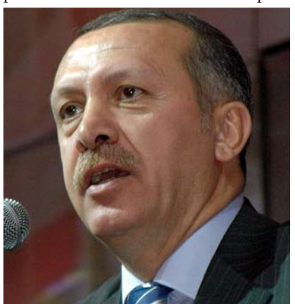
Erdogan: Only as much democracy as suits us.

In the 1980s and '90s, we were pleased to witness the fall of communism. After the Soviet Union collapsed and its terrible crimes were revealed. communism lost its credibility. The New Left then used the immigration problem to dress communism up as