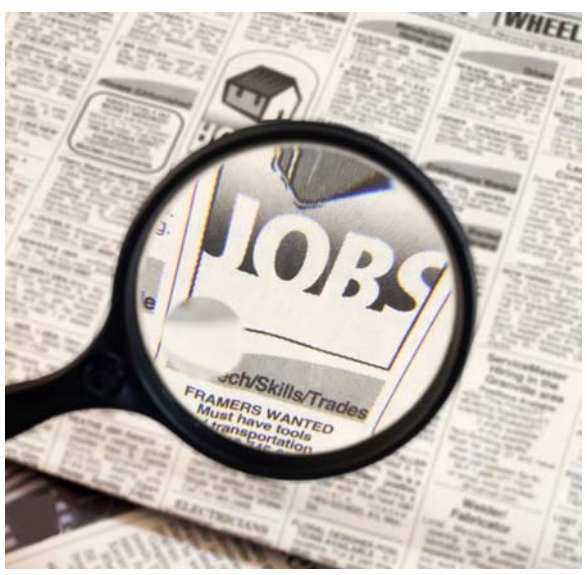
The biggest joke of all.

A prospective employer has to get a Temporary Labor Certification from the Department of Labor, which verifies that the above requirements are met. The employer then files a Petition for a Nonimmigrant Worker with USCIS on behalf of a prospective worker. The