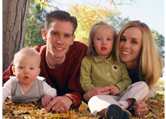
Not as many of these . . .

However, the figures for the percentages of non-Europeans in 2000 are underestimates because they are taken from census figures that do not include third-generation immigrants, who are counted as indigenous. Also, a number of immigrants do not fill in census forms—especially illegals, for obvious reasons. The projected figures for the year 2050 are also probably