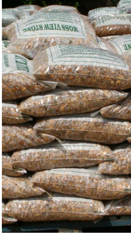
Now, lug these around.

of the recruiters did not encourage the callers to violate H-2B regulations, one Texas recruiter "suggested that we discourage American workers from accepting our landscaping job openings by having applicants run around the shop carrying a 50-pound bag to determine [whether] they were fit for the work.