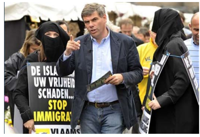
Filip Dewinter campaigns against the Muslim invasion.

This third invasion is not actual warfare. Of course, there is a terrorist threat, but the real battle is demographic. Muslims are "peacefully" overrunning Europe. Through mass immigration, conversion, propaganda, family reunification, and high birth rates Islam is marching on.