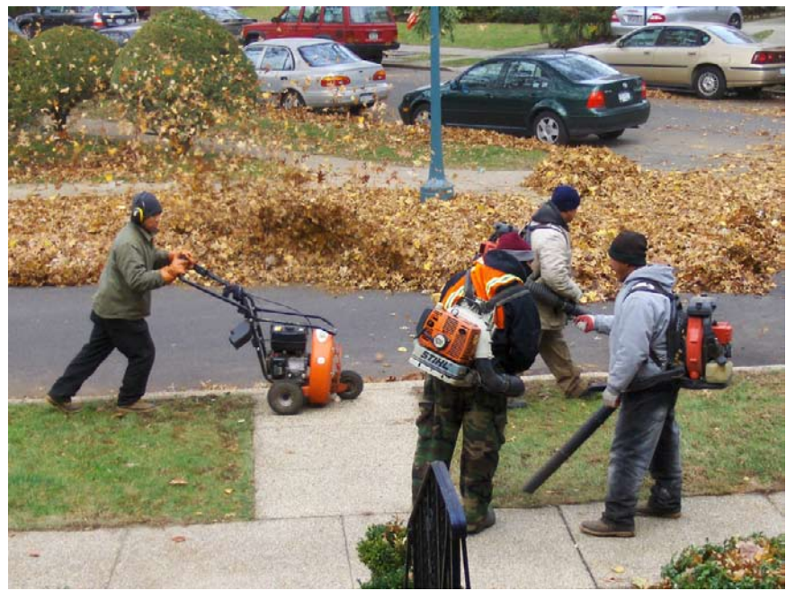
Are they illegals or are they on H-2B visas?

farm wages had to be doubled to attract Americans you would hardly notice the difference at the checkout counter. Harvesting typically accounts for only about 10 percent of the supermarket price of produce, so pickers could double their wages and an apple that