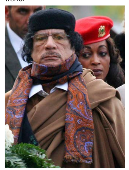
Col. Gadhafi and a female body guard. "Europe will turn Muslim."

The Left cultivates a number of guilt complexes in order to weaken European resolve. It trumpets racism, anti-Semitism, slavery, colonialism, and xenophobia as Europe's original sins. Because of this allegedly shameful record, the European people no longer have a right to their own identity, culture, and traditions. In the Leftist world view, European nation states are harmful anachronisms that are responsible for anything that goes wrong in this world.