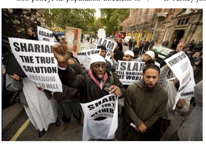
Could be anywhere in Europe but happens to be Holland.

In recent years, the working class has changed sides politically. Many ordinary Europeans who might have supported the Left during the heyday