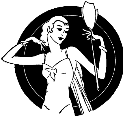
White skin privilege.

The “crits” do not yet control society but they control what they teach: “All aspects of the curriculum [must] integrate multicultural, critical thinking and justice concepts and practice.” “Diversity and equity issues are integrated into all aspects of the teacher-training curriculum.” This is necessary because, as one of the editors of the book puts it with breath-taking finality, “The purpose of education in an unjust society is to bring about equality and justice.” Thus,