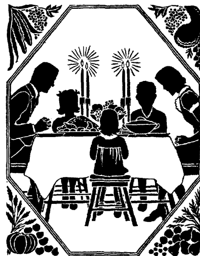
National day of mourning?

Once children are older, there are countless techniques for attacking “the dominant culture,” and the book suggests particularly lively ways to take the stuffing out of whites. Children can pretend to be Congressmen debating the Indian Removal Act of 1830, or can try to think of all the evil motives for the Chinese Exclusion Acts of the 19th century. They should put on a mock trial of “the profit system” as the cause of the drug trade, as they consider “drugs as a weapon against the Black community.” Students can draw cartoons about the “racism” they experience, or can collect tourist brochures about Hawaii and note that they fail to mention that whites seized the islands and raped the culture. They can discuss why Thanksgiving Day can be thought of as a day of mourning, or take turns answering the question: “What is your earliest recollection of being excluded because of your race or culture?” Whites can keep diaries of the unearned privileges they enjoy each