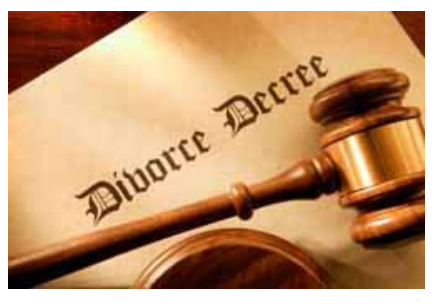
... unless we have less of this.

Sociobiologists speak of highinvestment versus high-fertility reproductive strategies, but it is clear the contemporary West does not fall into either category. We are practicing both low fertility and low parental investment. It is uncanny how many of the "progressive" causes being pushed among us involve thwarting procreation: female careerism, unrestricted abortion, so-called safe sex, and special political protections for homosexuality. A society that makes these things its priorities can only have a death wish.