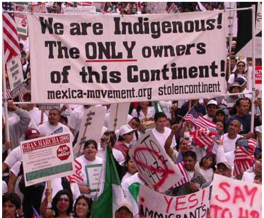
Mexicans in Los Angeles marching for open borders.

economic advance, and that it is doubtful whether even the huge immigration of skilled workers in the 19th century actually raised per capita output. He argues that over the last 100 years, only 10 percent of the tremendous increase in wealth in the West was due to increases in labor and capital combined . The crucial factors were new ideas and technical innovation, and surpluses of low-skilled labor slow down innovation. Japan invents robots; we hire Mexicans.