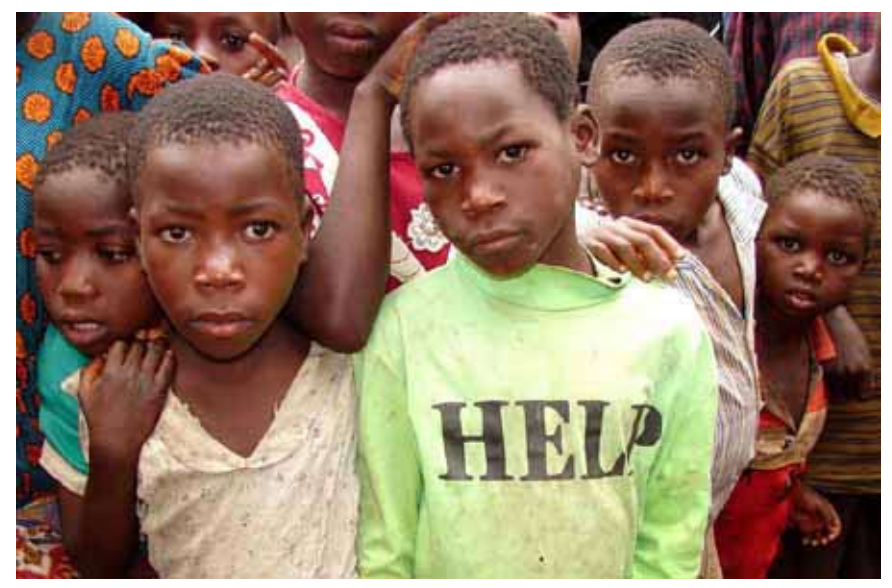
Whatever one may say about Africans, they are successfully reproducing.

It may be that Europeans are better adapted through evolutionary pressures to monogamy and deferred gratification, but it would be well not to presume too