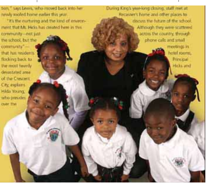
"Promoting educational excellence for all Americans."

A Martian who saw a US Department of Education newsletter called The Achiever could be forgiven for thinking the United States was somewhere in Africa. Almost every issue of what calls