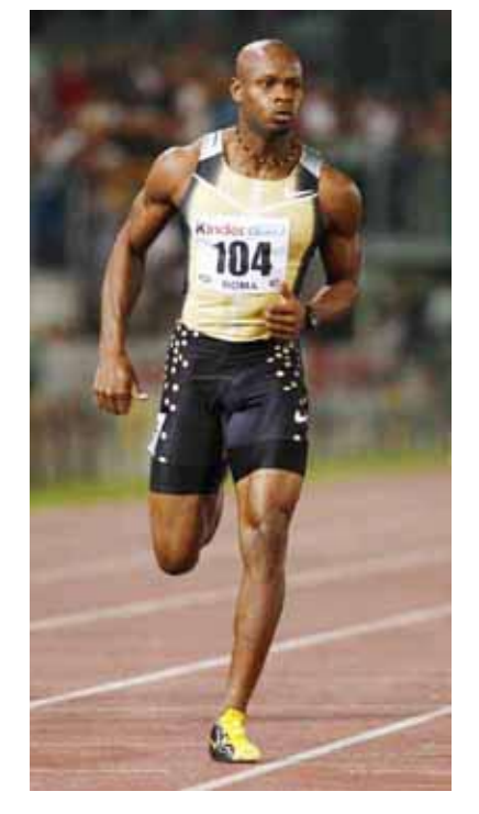
Not an East African.

To put it bluntly, Jews (we) have been the biggest promoters of that myth. I know it personally because I've written two books about race. It's axiomatic that as much as Jews fiercely