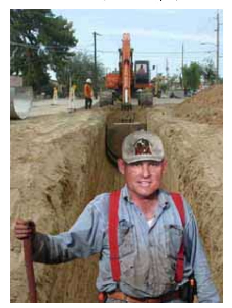
Jobs Americans won't do?

that immigrants account for 24 percent of all construction and mine workers, and that the native unemployment rate in those fields is a very high 12.7 percent. Native workers in the other professions with high concentrations of immigrants—building maintenance and farming—also suffer from high rates of unemployment. Mr. Camarota makes the further point that even in a immigrant-