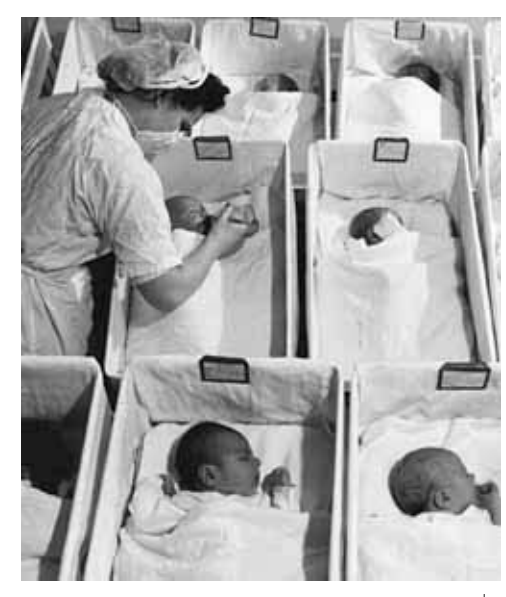
We will not have more of this . . .

In any case, economic independence means they do not need a man in the same way previous generations of women did.