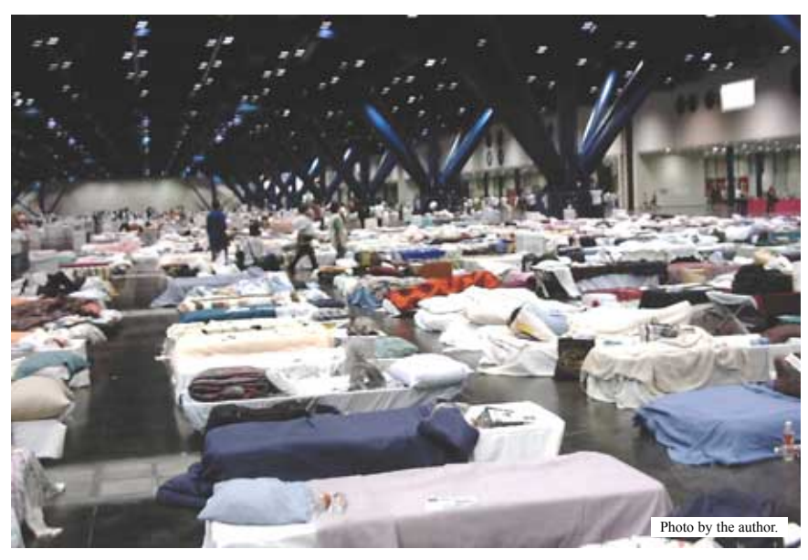
The Houston Astrodome—briefly my home after evacuation from New Orleans.

It was on the bus that it really sunk in—all we had been through and over-