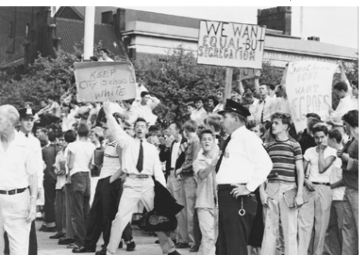
Demonstration against integration in Baltimore.

sociation in 1946, and in the trials that led up to the Supreme Court's Brown decision, he was the most prominent academic to testify in favor of segrega-