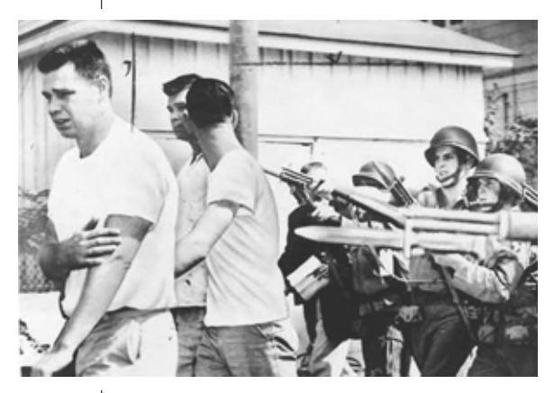
The 101st Airborne integrates Little Rock High School.