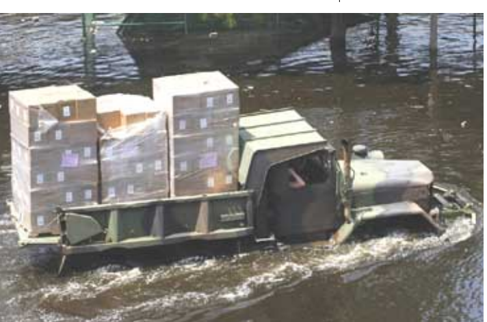
Supplying the Superdome.

That day, there was an elderly, blind black man wandering around lost by himself. He seemed to be in pretty bad shape. We tried to escort him to a guard station, but he wouldn't go. We gave him water and left him alone. I saw a little black baby—maybe about three years old—in nothing but a filthy diaper, wandering around in trash and broken glass looking for his momma. That was the first. The last two I saw like that didn't even have a dirty diaper on. I tried not