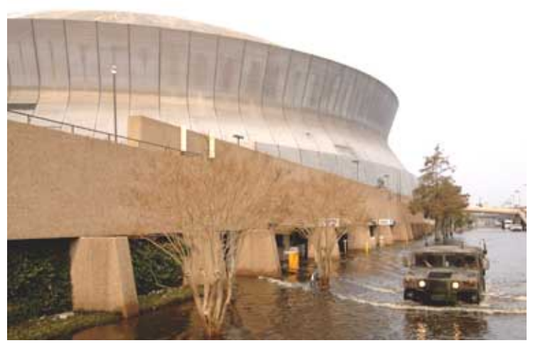
The Superdome was an island.

I got back home and rounded up a bunch of different-sized batteries and some tape, stripped a computer cable and wired it all up to my boom-box and finally got a news report. I was shocked.