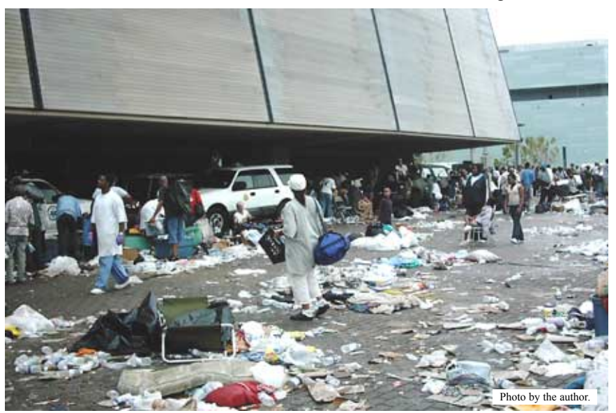
This is what the plaza of the Superdome looked like on Wednesday, Aug. 31, when I first got there. It became much more crowded later.

reports. Katrina was going north; Katrina was coming west. The mayor had ordered mandatory evacuations; the mayor had ordered voluntary evacuations. All roads out of town were grid-locked. No