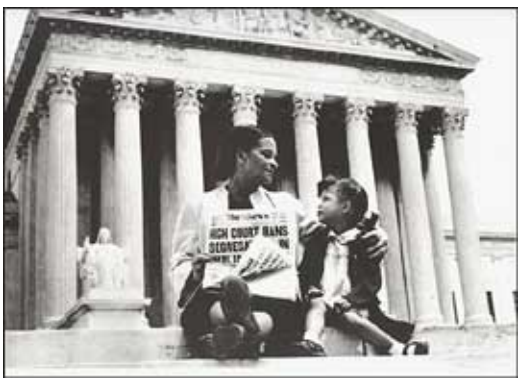
Celebrating Brown v. Board.