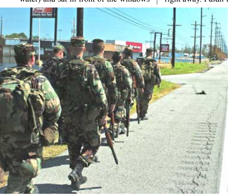
Armed rescue in New Orleans.

I also listened to the radio. More stories of rooftop rescues, a confirmed report of a cop shot in the head when he tried to stop looters, a desperate call for help from someone in a retirement highrise full of sick people, and conditions getting worse still in the Superdome. I cooked a hot meal (still had gas), and took a cold shower (still had running water) and sat in front of the windows