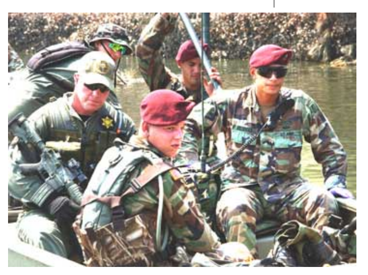
More armed rescue.

surrounded by angry blacks. Apparently, the dome had become a "blacks only" area, and I was "white-boy," "white-bread," "white mutha fucka," "cracka-ass bitch," or "ho." I found a piece of cardboard, cleared a patch of the cobblestone plaza of trash near a National Guard outpost, and lay down to rest. It was a very long night.