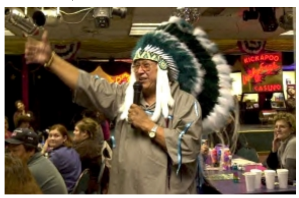
Make him pay taxes.

As everyone now knows, California is struggling to cover a $38 billion budget deficit. As it happens, there is a whole class of Californians who do not pay