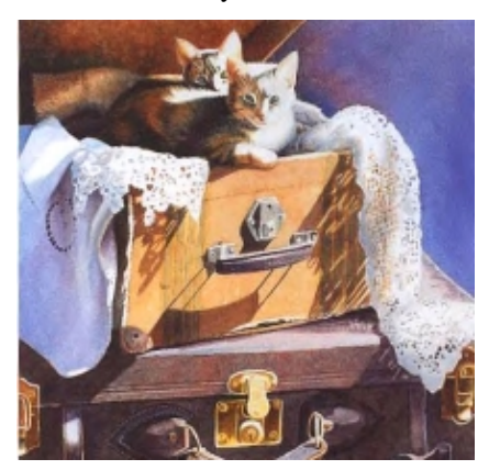
Cats on a suitcase.

Many of my clients are unable to explain even the most basic facts. Often they must take the witness stand, and no matter how many times we have gone over the testimony in advance, I can be