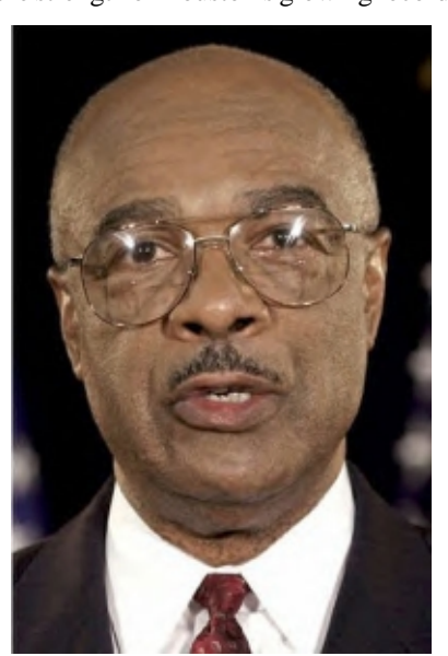
Rod Paige: fake miracles.

The Houston, Texas, school district has been the crowning achievement in "the Texas miracle," according to which the state has made impressive progress with "at risk" students. It was largely on the strength of Houston's glowing record