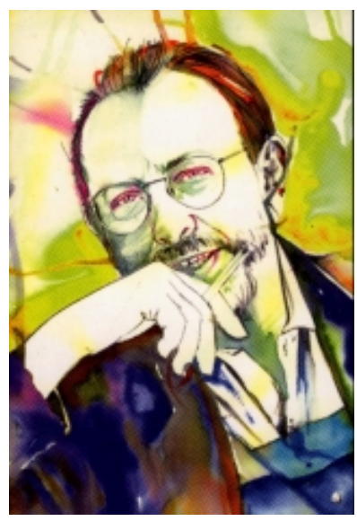
Alain de Benoist

facts and basic political and social issues hushed up, and dissidents silenced as bigots and haters. The consequences have been catastrophic: political unresponsiveness, bureaucratic tyranny, unchecked cultural degradation, and—to