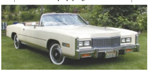
More important than house or kids?

called. A black debtor—not my client—was before the judge trying to convince him to approve his bankruptcy repayment plan. The judge told him he could not afford both his Cadillac and his children, and had to give up one or the other. The debtor immediately said he could not give up his car, and therefore the judge would have to take his kids. The judge threw up his hands and walked off the bench. On another occasion, the same bankruptcy judge told a black