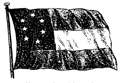
Not a purely racial appeal.

White racial separatism presumably would center on race, pure and simple, as the basis of separation, and in all the history of the white race and its various civilizations there is no precedent for that degree of racial consciousness. Even the Confederacy did not make such a purely racial appeal but combined it (usually incoherently)