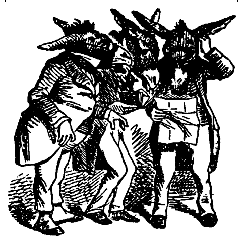
Congressmen at work on Civil Rights bill.

No one could think of an equally subtle and elegant way to adjust the effect of other kinds of job standards.